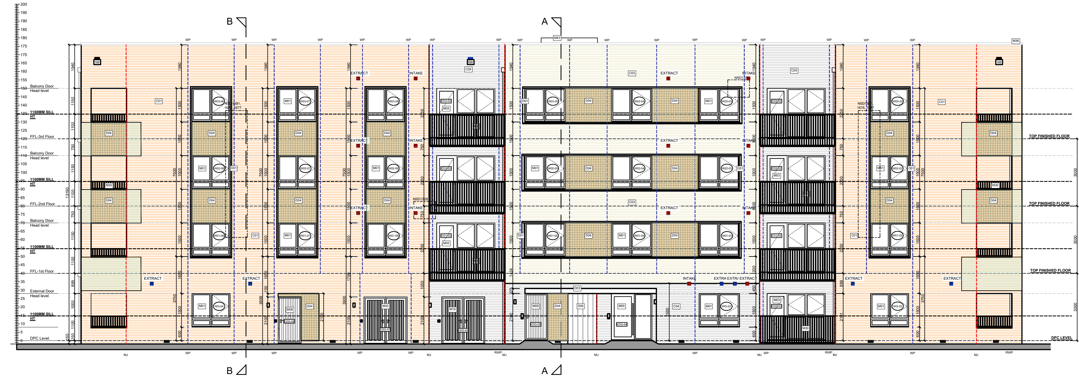
North West SCALE 1:100 SP: Spandrel Panel